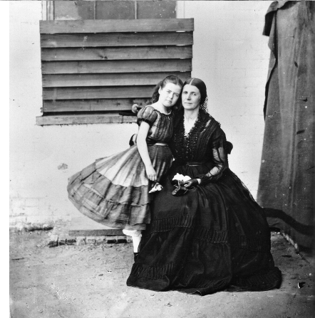
Harriet Tubman and other women spies for the Union army